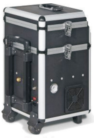
Ready to move

Take your art on-the-go with Iwata Maxx Jet. This powerful airbrush compressor is built-into a convenient rolling-case that has storage space for your stuff. It is ideal when you need low to high output from 1-60 psi. The dual manifold air compressor is set up to operate one airbrush and one mini spray gun such as Iwata Eclipse G Series and RG-3.